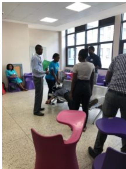
Participants carrying out a simulation

Prior to welcoming our participants, we held a Training of Trainers session for the facilitators in which we honed our own skills in lesson planning, teaching, and feedback. The following day, we were met by an enthusiastic group of participants made up of registrars, nurses, and a pharmacist. Throughout the course, the group were very engaged and actively participated in all aspect.