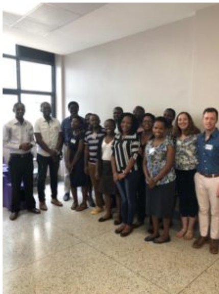
Participants and facilitators after the certificate ceremony

Finally, at the end of a successful course, eleven participants were awarded certificates of completion after we heard their large and small group presentations.